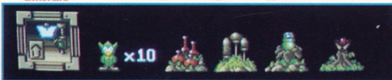
FLYING MACHINE E F G H