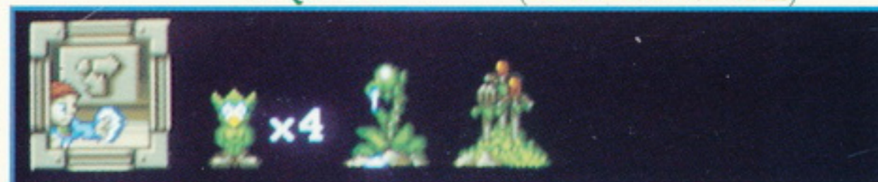
FIRE DOWN 2 ACROSS B C

ITEMS FOR SALE NO. OF PETS REQUIRED COMBINATION OF HERBS REQUIRED (SEE OTHER SIDE FOR NAMES)