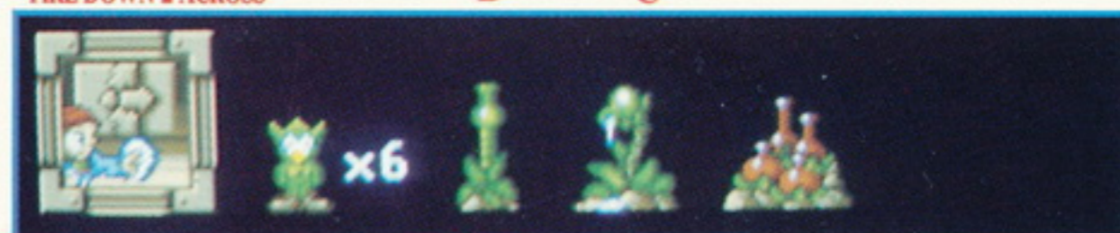
FIRE DOWN, UP 2 ACROSS A B E