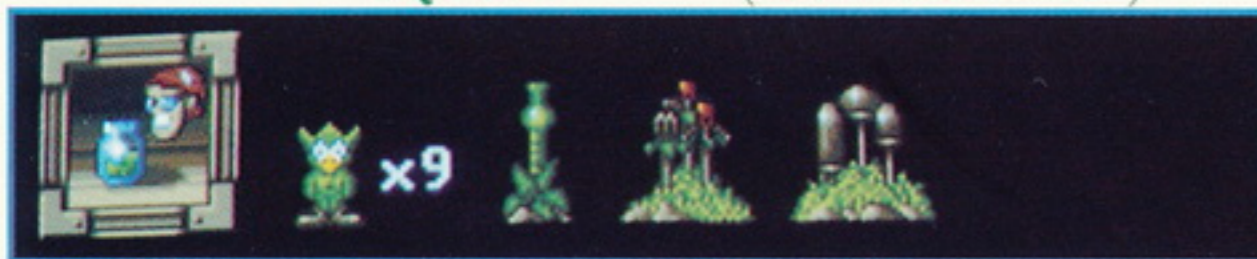
HERO A C F

ITEMS FOR SALE NO. OF PETS REQUIRED COMBINATION OF HERBS REQUIRED (SEE OTHER SIDE FOR NAMES)