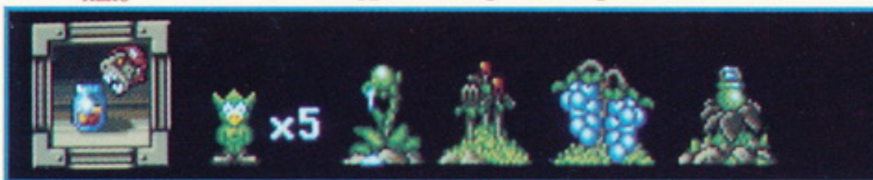
WOLF B C D G