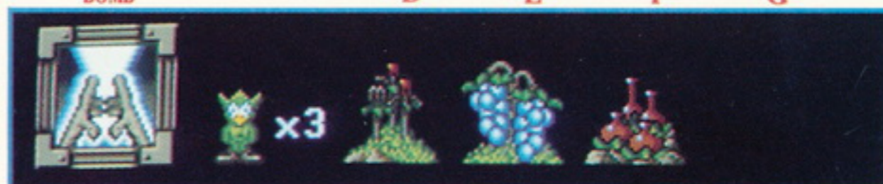
SHOT SPEED 1 C D E