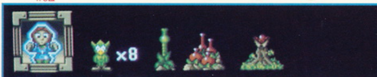
EXTRA LIFE A E H