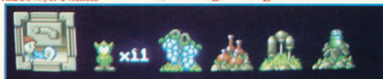
BOMB D E F G