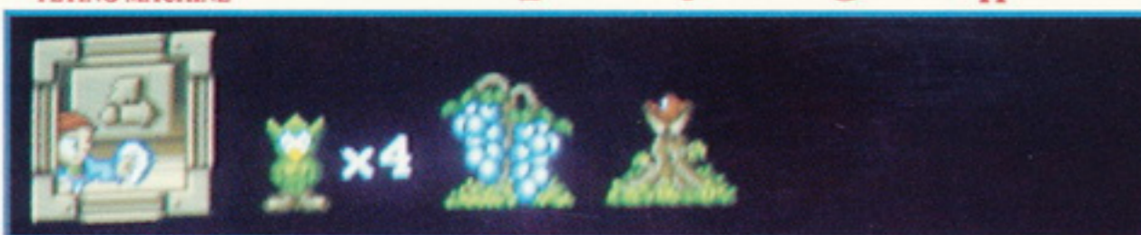
FIRE UP 2 ACROSS D H

ITEMS FOR SALE NO. OF PETS REQUIRED COMBINATION OF HERBS REQUIRED (SEE OTHER SIDE FOR NAMES)